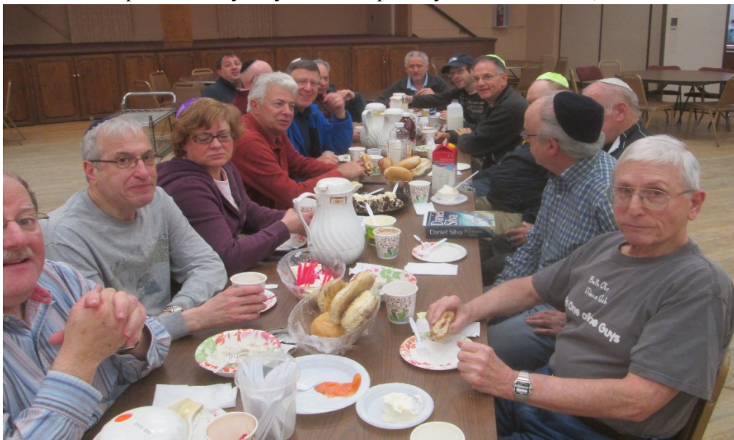
Photo from a prior Sunday. If you have a photo you want to share, email it to emcpa1@aol.com .