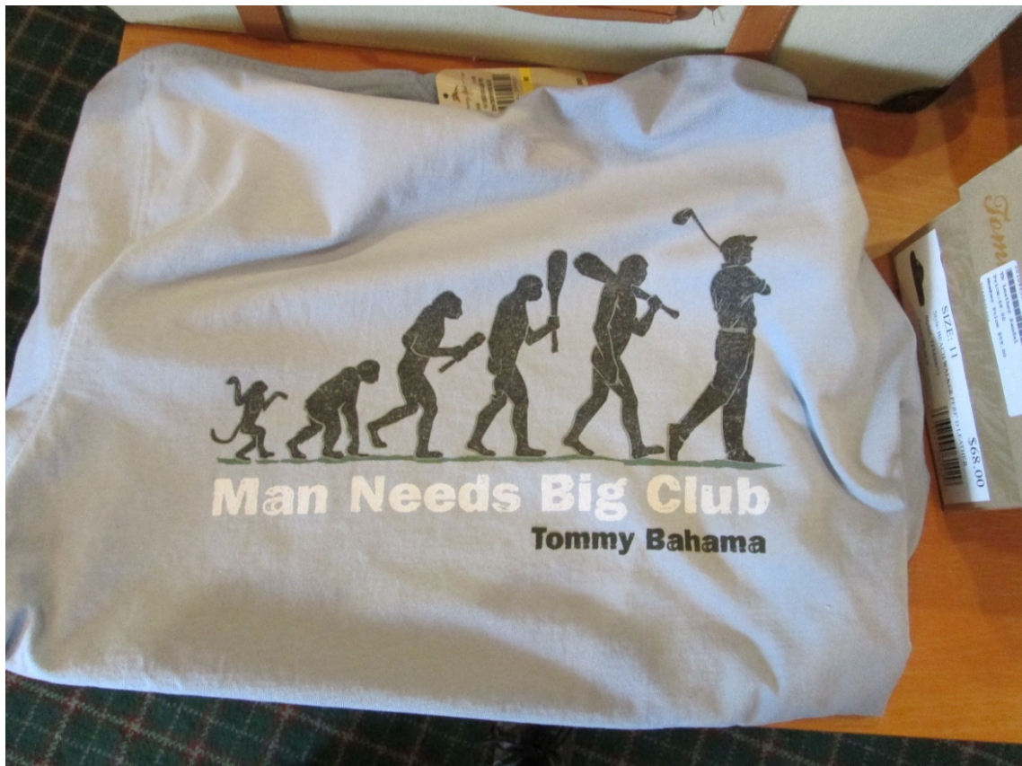
Photo of the Week from a Tee shirt