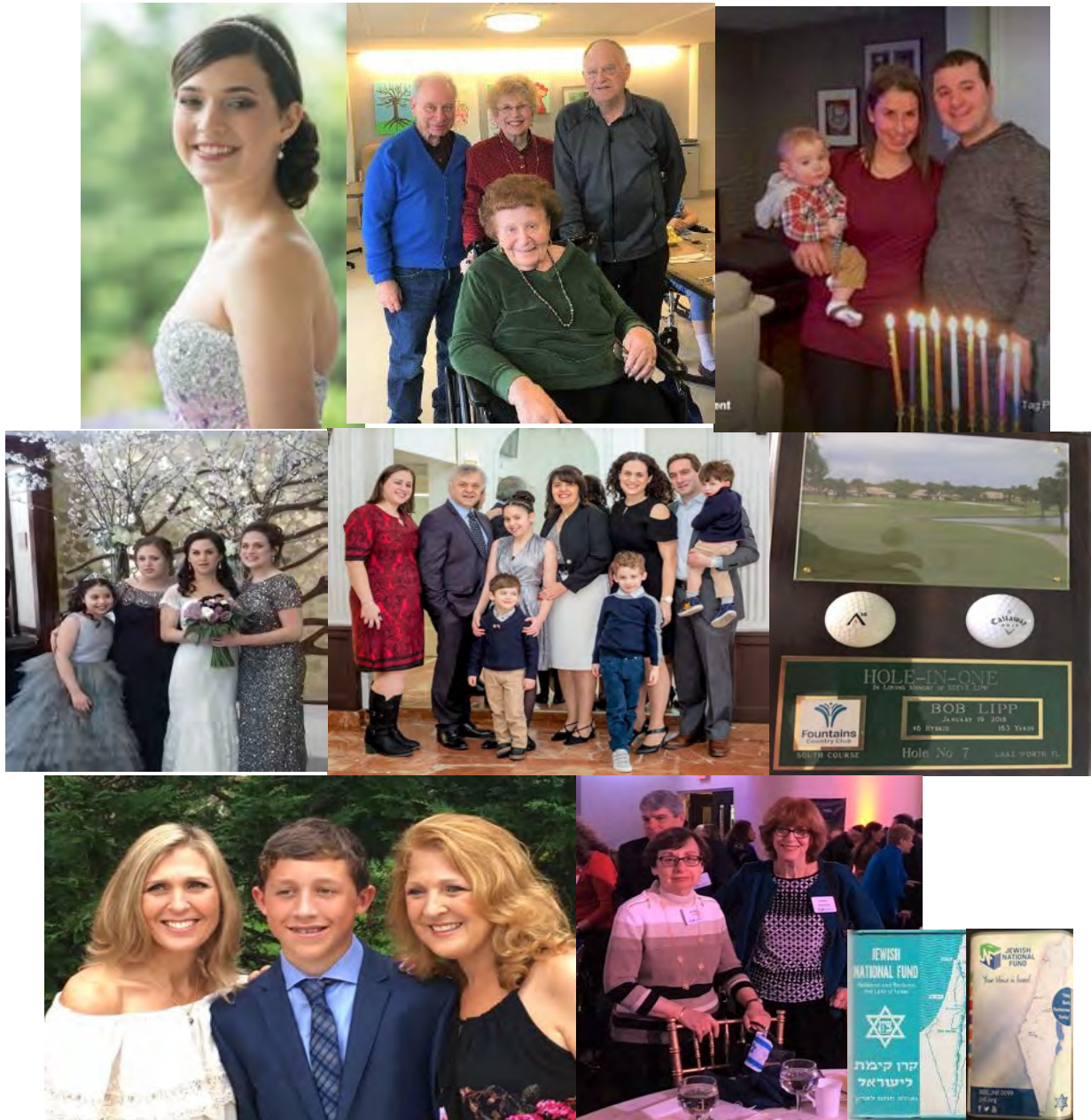
Photo Gallery, Part 2