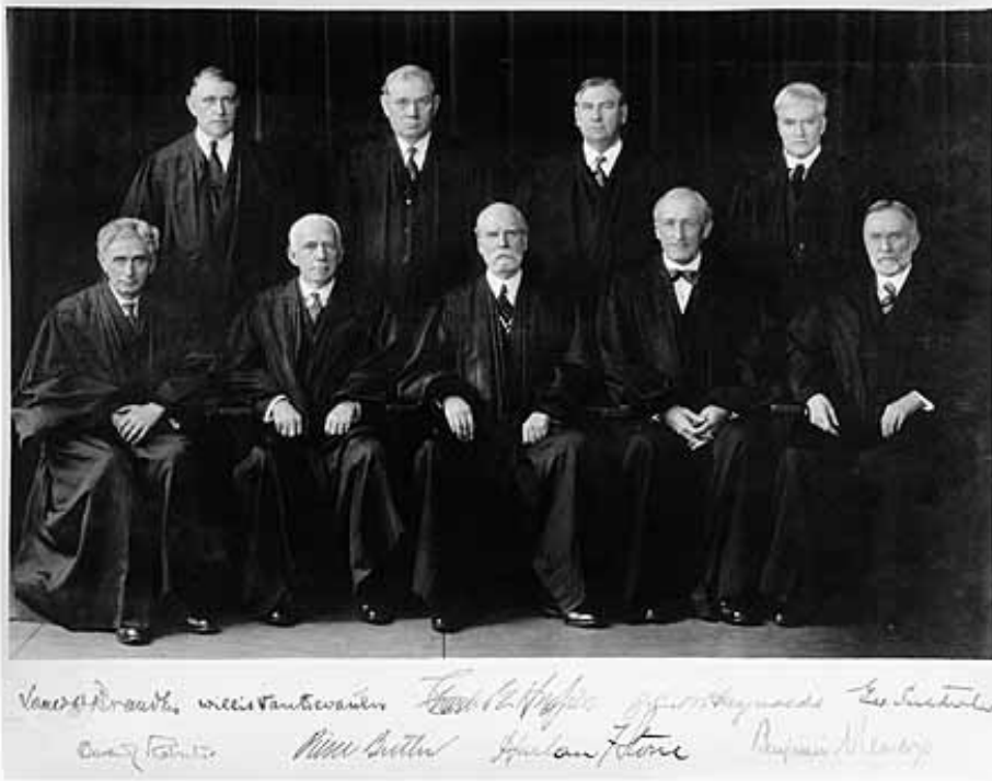
Supreme Court of the United States—The Hughes Court, 1932–1937 with two Jews: Justices Brandeis and Cardozo.

Front row: Justices Louis Brandeis and Willis Van Devanter, Chief Justice Charles Evans Hughes, and Justices James McReynolds and George Sutherland. Back row: Justices Owen Roberts, Pierce Butler, Harlan Fiske Stone, and Benjamin Cardozo.