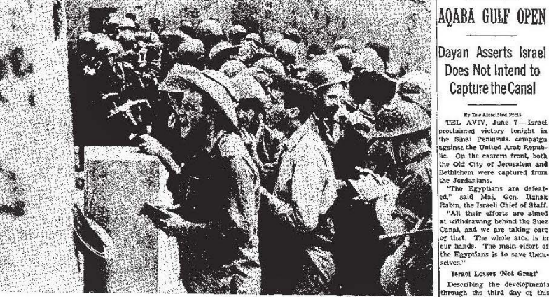
OLD JERUSALEM IS NOW IN ISRAELI HANDS: Israeli soldiers in prayer at the Walling Wall yesterday.

By DREW MIDDLETON Special to The New York Times UNITED NATIONS, N. Y. June 7—The Security Council unanimously adopted a Soviet resolution today calling on the combatants in the Middle East to "cease fire and all military activities" at 4 P.M. New York time today.