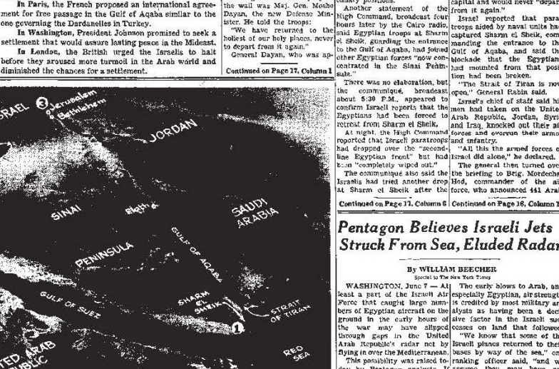
CONQUEST IN THE MIDEAST: Israeli troops took Sharm el Sheik (1), drove on to the Suez Canal (2) and seized control of the Old City in Jerusalem (3). Photo was taken in September, 1966, during the flight of Gemina II.